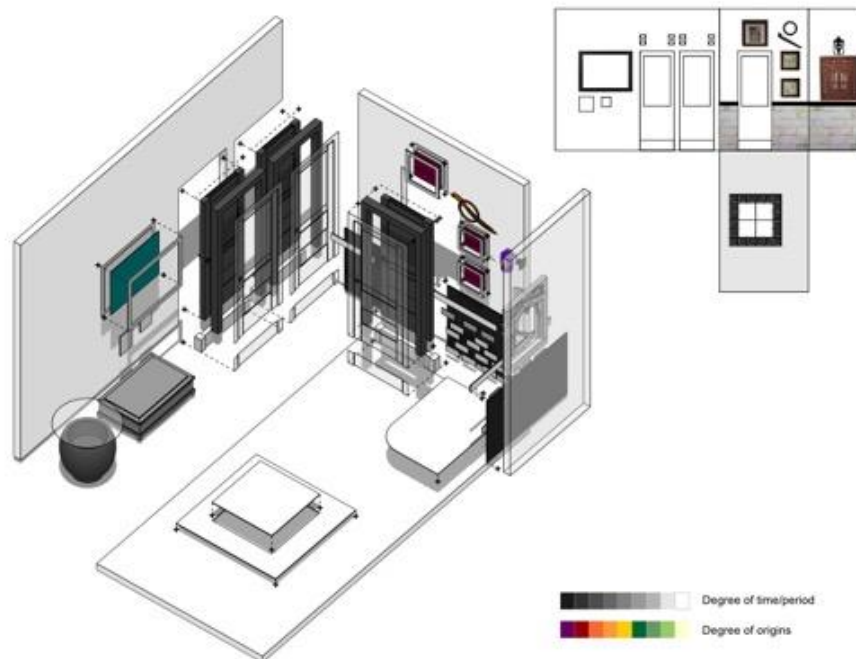
Fig. 7: Developed surface interior and exploded view drawing of the right collection corner space

A similar collage reading can also be identified in another part of the collection corner space in this house. The space is located opposite the previous collection space, where both flank the reception hall in the middle (Figure 7). It is constructed by three perpendicular walls but only united by the floor plane. Meanwhile, the wall in the middle has an opening that is continuous to another space behind it.