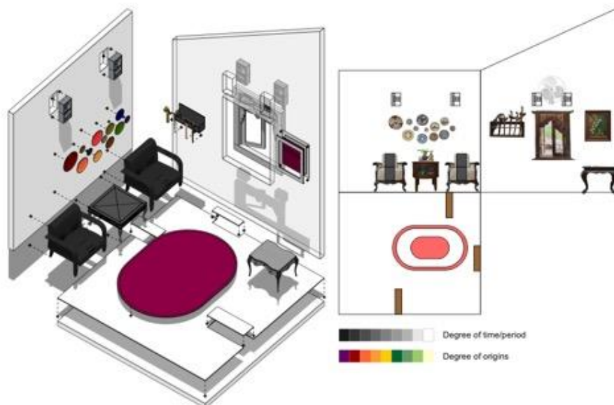
Fig. 6: Developed surface interior and exploded view drawing of the left collection corner space

A set of Javanese-style chairs attached to one of the walls were arranged in the same composition applied to the reception hall, symmetric composition flanking a Javanese-style table also from the same origin (Figure 6) However, the juxtaposition of a similar object in this space cannot construct the same value and meaning as in the previous one. The construction of meaning in this space is strengthened by the presence of collectible objects that play a role in rearranging stories that have existed in the past, and present and will continue to change in the future.