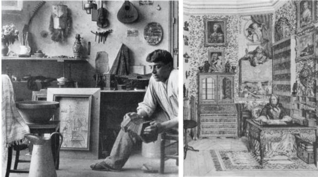
Fig. 1: Left: Young Georges Braque in his studio at the Hotel Roma, 1911 (Image by Modern Now) Right: Ulla Tessin in her study room Source: Olof Fridsberg

Other collage-reading can also be identified in Countess Ulla Tessin's study room (Scalbert, 1999). Objects were collected and arranged to transform her fashionable taste from the inherited Dutch style into something new and exotic. The Rococo desk was placed with a clock above it, and a Chinese vase was placed above the bookcase. New Chinese wallpaper and a Persian rug appear together with Japanese porcelains, stones, and other foreign objects. They all came from disconnected origins and were juxtaposed with each other to express a wild, fancy interior that engages the Countess with a feeling of intimacy in the space (Figure 1 right). All examples of interior reading as collage demonstrated how collage can also be used as a narrative instrument through how organizing objects in the making of interior space.