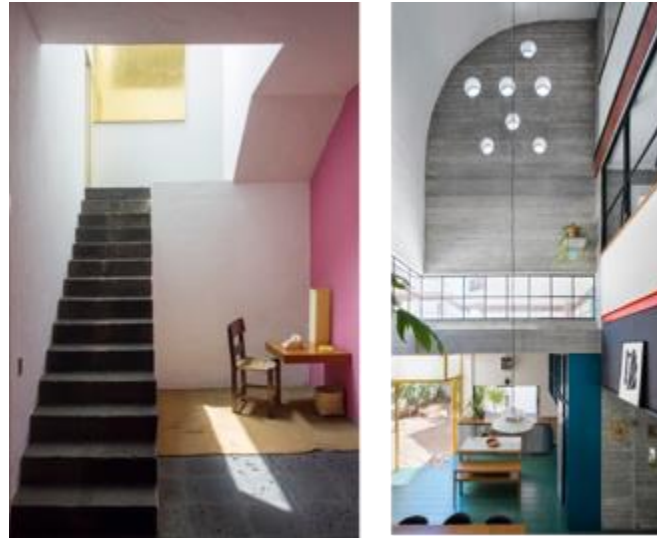
Fig. 2: Left: Casa Baragan (Image by Julian Weyer) Right: Petralona House Source: Point Supreme

In Petralona House, the materials that were already available played an important role in the design (Figure 2 right). The architect gave a new purpose to a fragment of Greek history. The houses borrow elements from the rich textures of Athenian culture to build a new history through new architecture and material analysis. It is a celebration of the richness of the country's creative heritage in the form of a bricolage, where materials accumulated from all over the city are brought together to create contemporary spaces and construct individual narratives of the rooms and spaces of the city house.