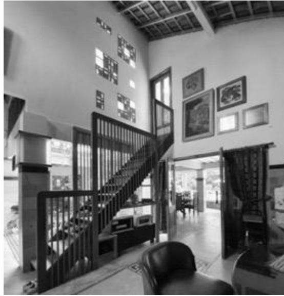
Fig. 8: Staircase hall: Layer of transparency

Other objects such as paintings and patchwork show layering techniques in the matter of objects' detail. With the goal of erasing old stories, all the painting's frames and patchwork were covered with new gold paint. It is no longer possible to identify the layer of origins owned by each object when this technique has indirectly deleted the history, layers of time, and origins embedded in any previous objects. New meanings can be created concerning other objects or elements or their transformation into new entities in new contexts (Waldman, 1992).