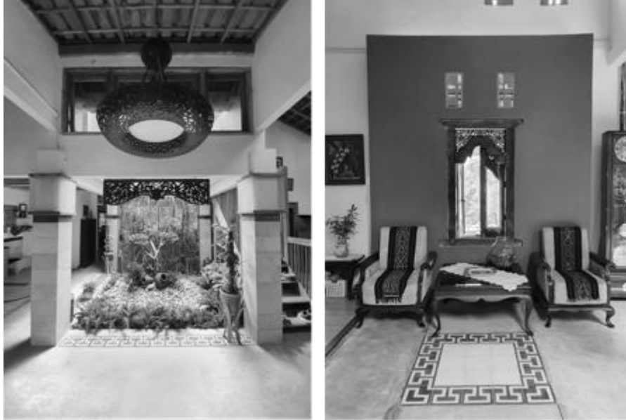
Fig. 3: Reception hall. Left: The juxtaposition of an abstract and tactile element. Right: Juxtaposition of objects from disconnected time and origin

all parts of the house. This void formed a dialogue between the interior and exterior through the presence of transparency in the threshold. This continuity of the surface shows the ambiguity between the interior and the exterior and shows the shifting impression of the foreground, middle ground, and background that involved and detached from nature. It shows the capacity of collage to express various spatial and material conditions by the dynamic of light that penetrates through the interior void.