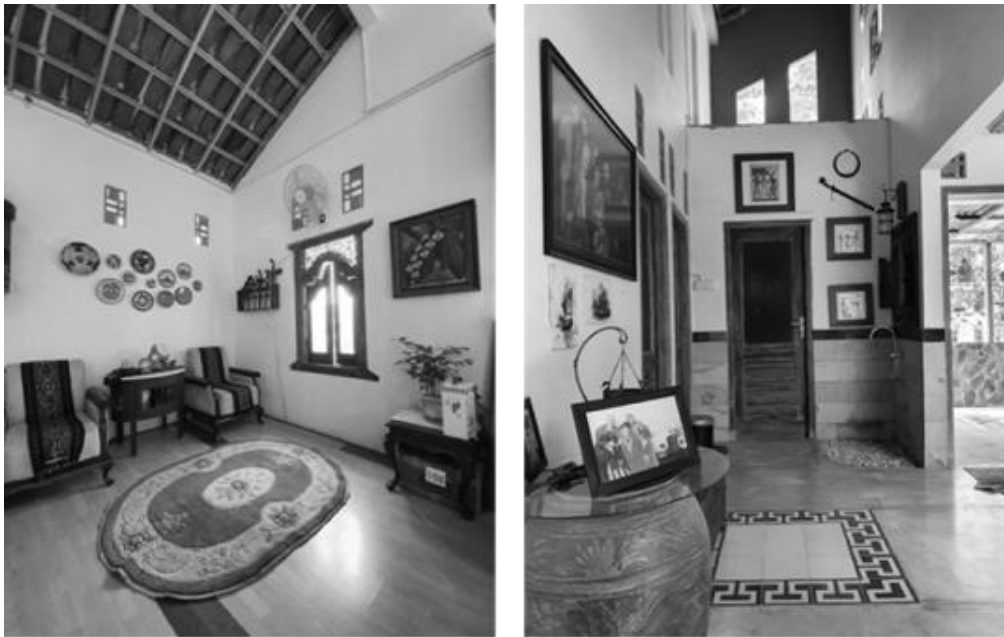
Fig. 5: Collection corner space. Left: The dialogue of collectibles. Right: The dialogue of materials from disconnected time and origin

collection of ceramic wall decorations, a collection of 'keris' (dagger) passed down from several different generations, and a painting that someone in the past gave.